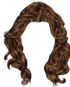
fig wig pig